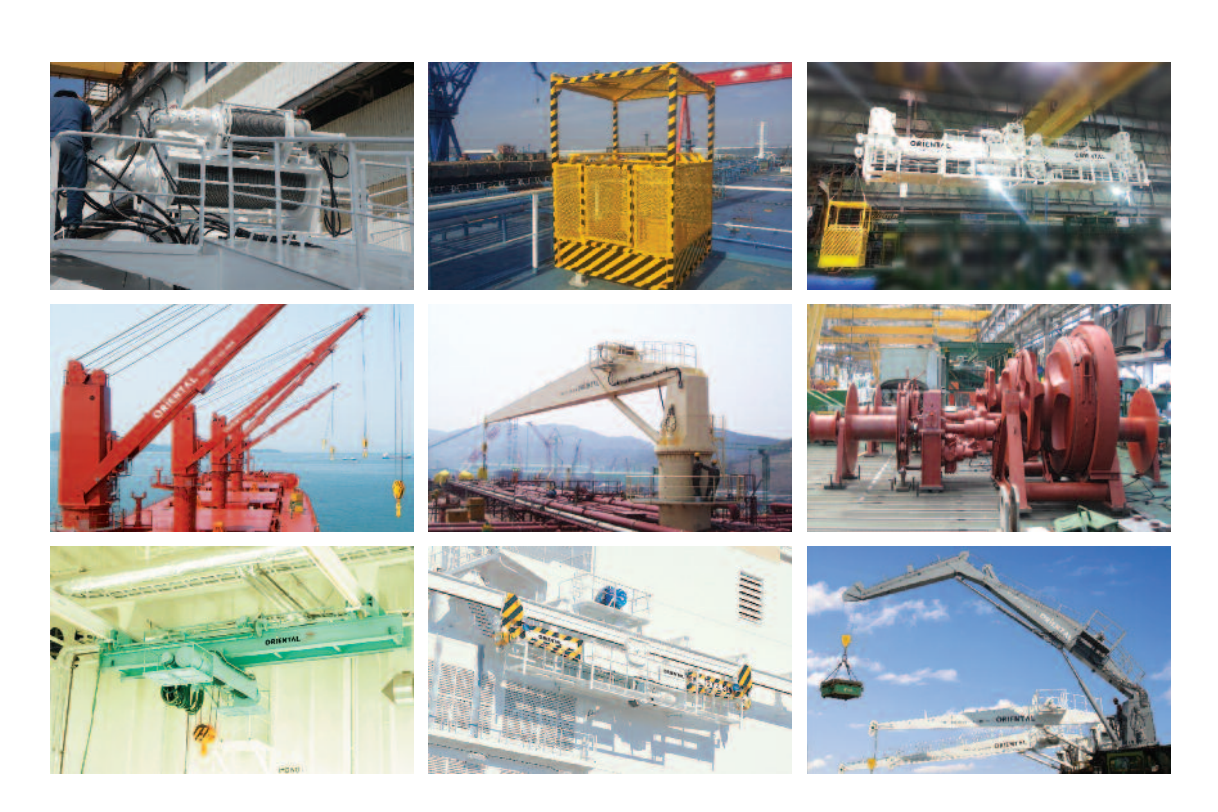
With a great dream towards a brighter future And for your success the journey continues